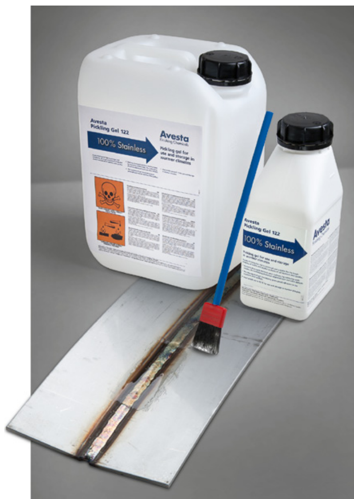
Avesta Pickling Gel 122 is intended for brush pickling of welds and surfaces.