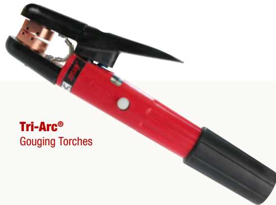
Tri-Arc® Gouging Torches