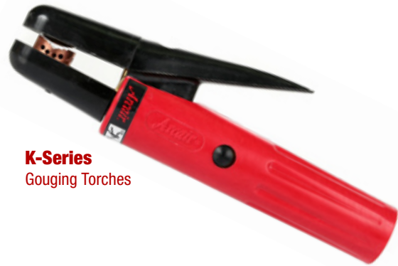
K-Series Gouging Torches